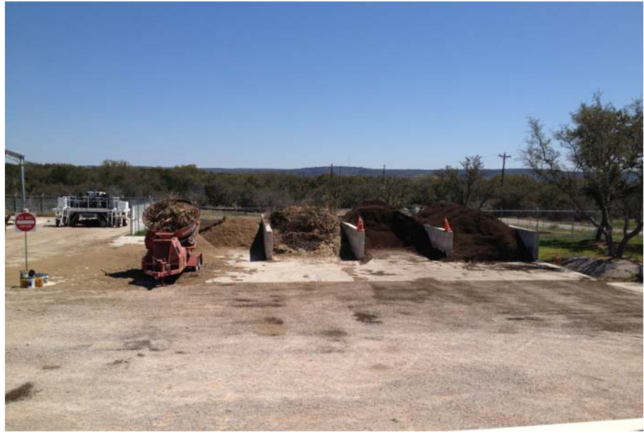
KMUD Compost Facility