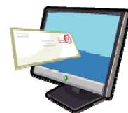
Pay Online through Your Bank