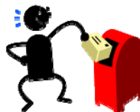
Mail Your Payment

Drop-off or Mail-in your payments. The office is located at 100 Ingram Street and the hours are 7:30 AM to 5:00 PM.