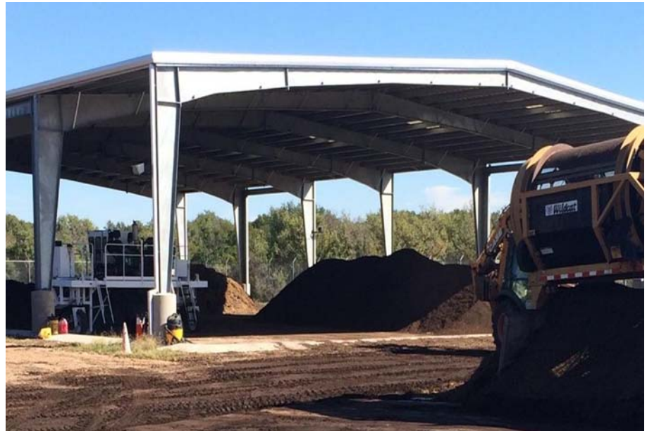
KMUD Compost Facility