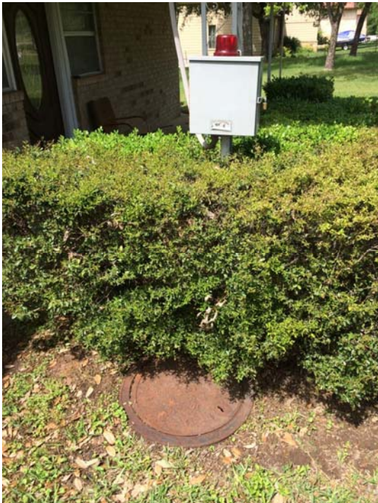
All shrubbery must be removed from in front of the panel box allowing complete access.