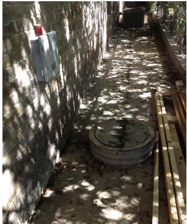
Do NOT place concrete, or any other similar obstructions around the tank. Do not enclose or brick in the panel. The conduit from the panel to the tank (above) is obstructed and inaccessible for replacing. Do NOT place a deck or other obstruction over the tank (see below).