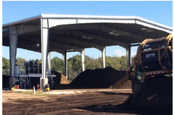
KMUD Compost Facility

Unbagged per 1/2 cubic yard: $12.50 Bagged Compost: $3.50 / bag Bagged Compost by Pallet: $150.00 By the Pallet is 49 bags